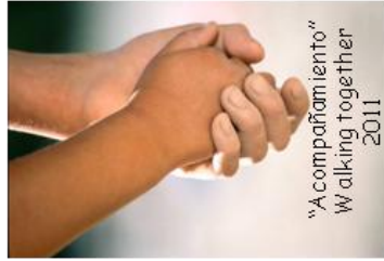
“Acompañamiento” Walking Together 2011

Name: _____ E-mail: _____ Telephone: _____ Address: _____